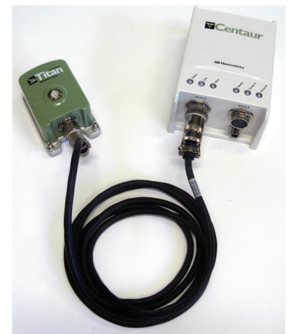
Titan accelerometer connected to and powered by a Centaur digitizer

Combine the Titan with the Centaur digitizer to achieve a complete data acquisition and recording system that is suitable for deployment in both remote and networked locations.